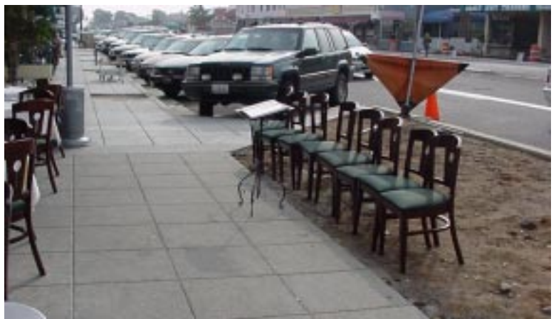
Above, chairs playfully occupy a corner bulb-out awaiting flowers while, at left, sidewalk tree wells anticipate the addition of palm trees.