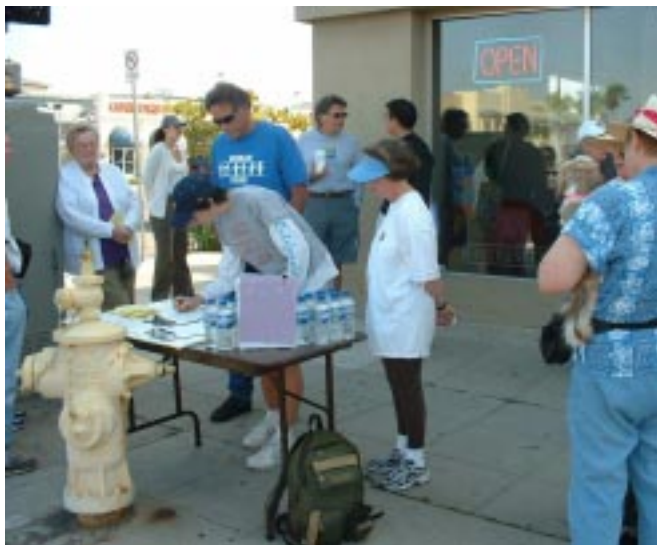
Walkers sign-in at the April 13th "Feet First" walking tour in Hillcrest. Featuring "The Vibrant Urban Village" theme, 35 participants explored this unique community of SanDiego.