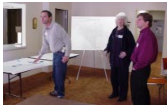
Participants in the "Feet First" stakeholders meeting debate which streets and intersections most need pedestrian enhancements.

The two organizations will also collaborate on a campaign to encourage residents to walk to local shops, simultaneously improving their health and supporting neighborhood merchants.