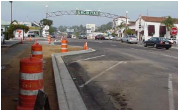
New curbs and a corner bulb-out narrow the roadway.

lighting, diagonal parking, narrower lanes, colored crosswalks, and corner bulb-outs.